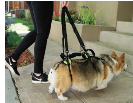
Like a sling! The two handles can be connected in multiple ways to allow you to lift like a sling. Or just use one across the hips or shoulders to add support where it's needed.