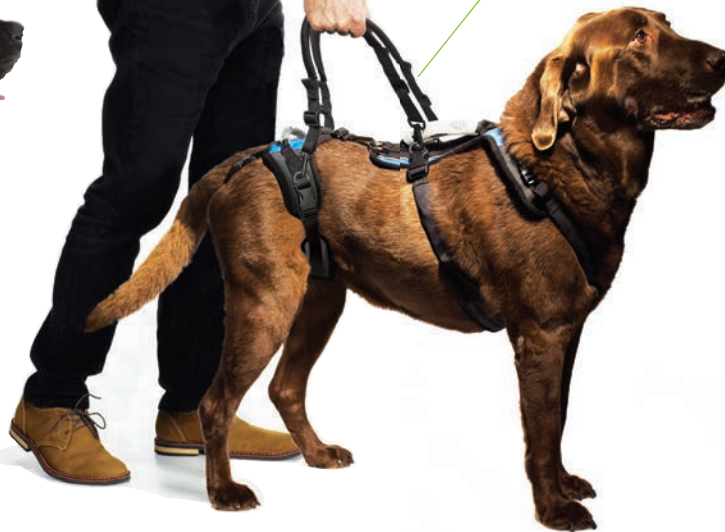
The New XS/S/M & L/XL Walking Loop Handles

The XL WL/SS & Med-Lg WL/SS Both allow you to add a shoulder while lifting and walking even on the largest dogs! Both work well walking and supporting dogs who may have issues urinating or defecating.