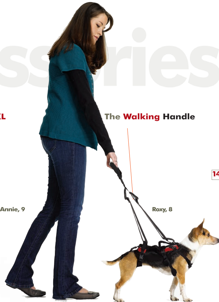
The Walking Handle

Front to back or side to side or just one at a time you can turn your harness into a virtual sling. They're soft padded, flexible and easily adjustable to let you add extra support when lifting or walking your dog.