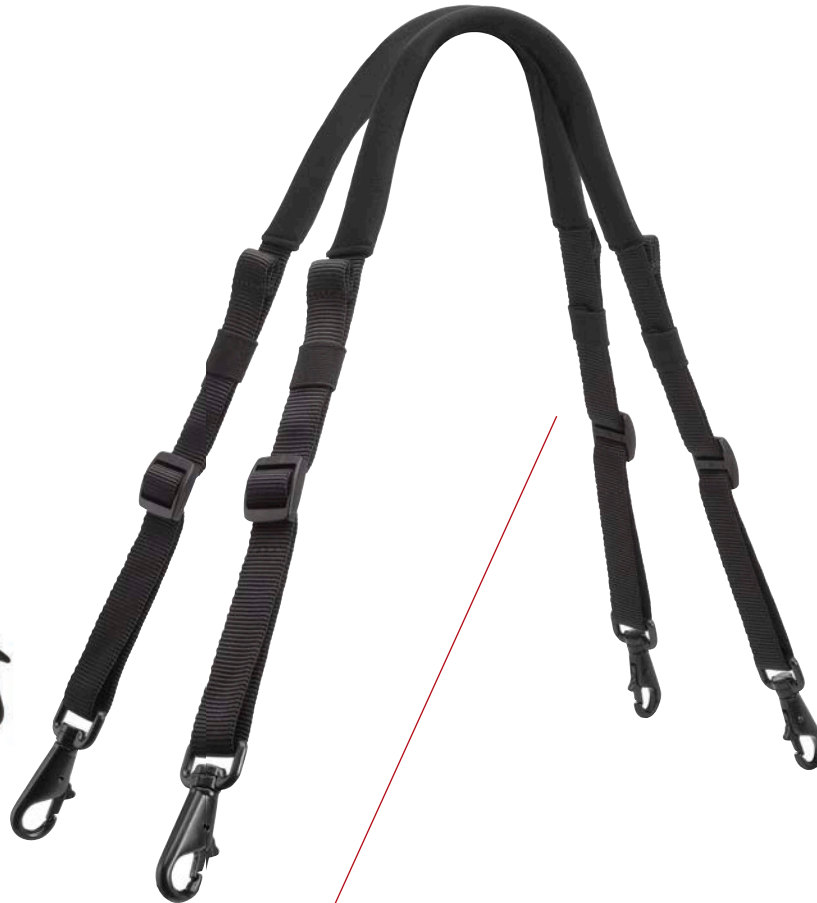
New! Walking Loop Handles [Sold in Pairs] Two Sizes: XS/S/M & L/XL Length: XS-M Max:46"Min:20" L/XL Max:38" Min:22" Width: XS-M 3/4" L/XL 1" Weight: Max: XS/S/M 10 to 80 Lbs L/XL 80 to 225 Lbs