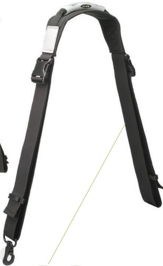
The Walking Leash Shoulder Strap Two Sizes: M/L & XL Length: M/L Max:66" Min:21" XL Max:69" Min:24" Width: M/L 1.5" XL 2" Weight: Max: M/L 125 Lbs XL 225 Lbs