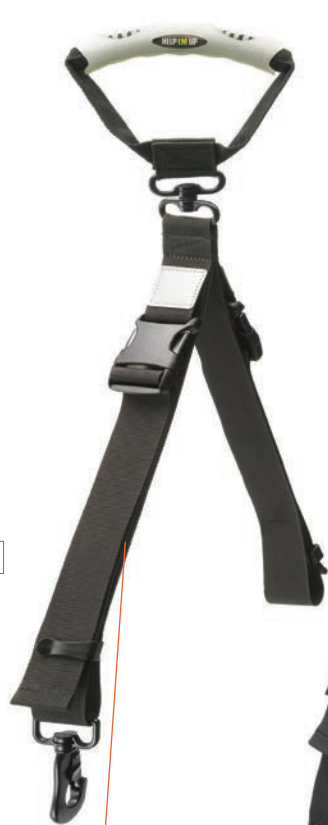
The Walking Handle One Size Length: Max:21" Min:8" Width:1.5" Weight: Max:125 Lbs